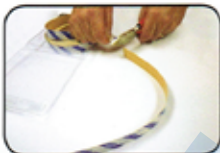
Cut Fastedge to the approximate length.