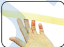
Flat and ready to apply.